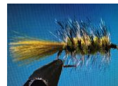
WOOLLY BUGGER ~ ONE OF THE FLIES YOU'LL LEARN TO TIE

Our 2019 Beginning Fly Tying Class starts on January 9 th . Registration will be open only to club members until December 15 th , after which non-members may register.